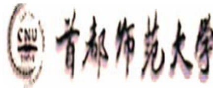
Capital Normal University