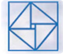
AMSS, Chinese Academy of Sciences.