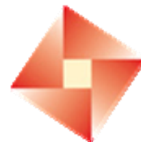
Chinese Mathematical Society