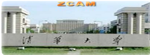
Zhou Peiyuan Center for Applied Mathematics, Tsinghua University